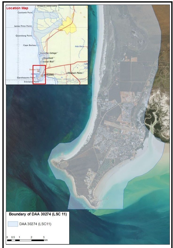
Map 2. Location and extent of DAA 30274 over Broome