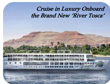
Cruise in Luxury Onboard the Brand New 'River Tosca'