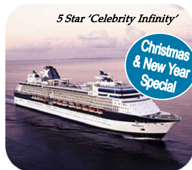
5 Star 'Celebrity Infinity'

Includes flights ex Sydney, most meals and transfers.