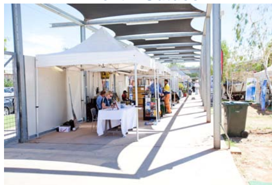
A Tent – Outdoor