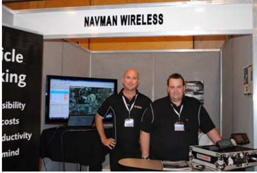
Standard Booth Entertainment Centre